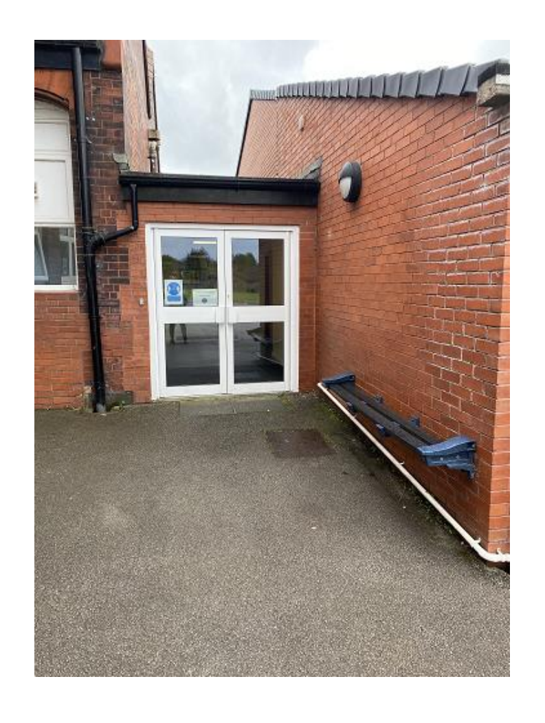
This is the main entrance for Lower Key Stage 2. I will walk into school through this entrance. That is OK.