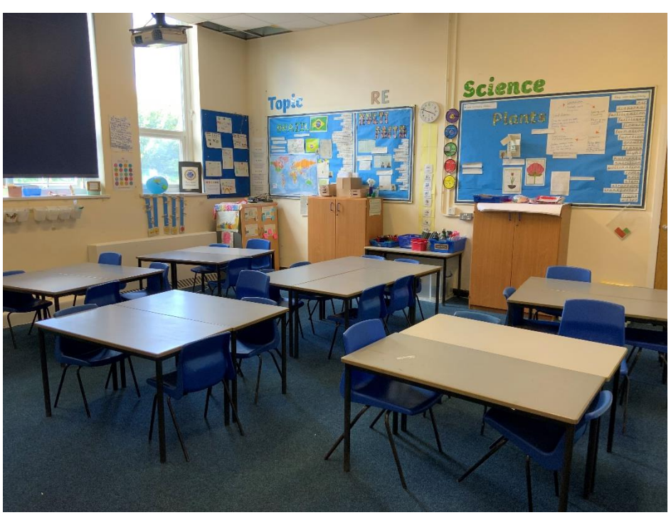
This is my classroom. I will be in Year 4 Pear.