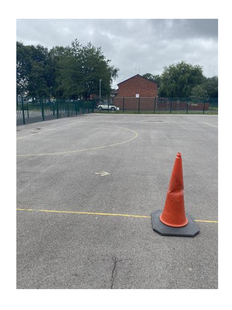
I will line up with the children in my class here in the morning. That is OK.