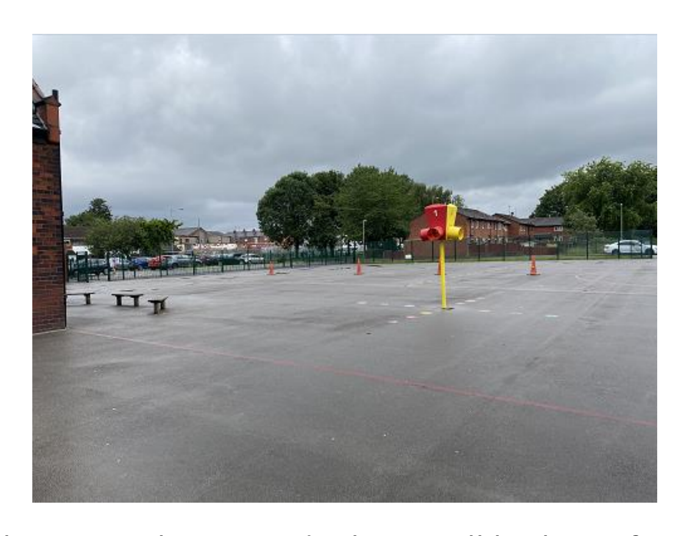
This is the main playground. There will be lots of people on the playground in the morning. That is OK.